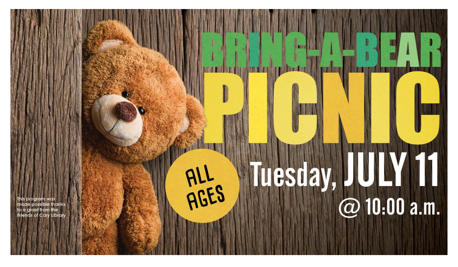
I am going to the Bring-A-Bear Picnic! A Social Story